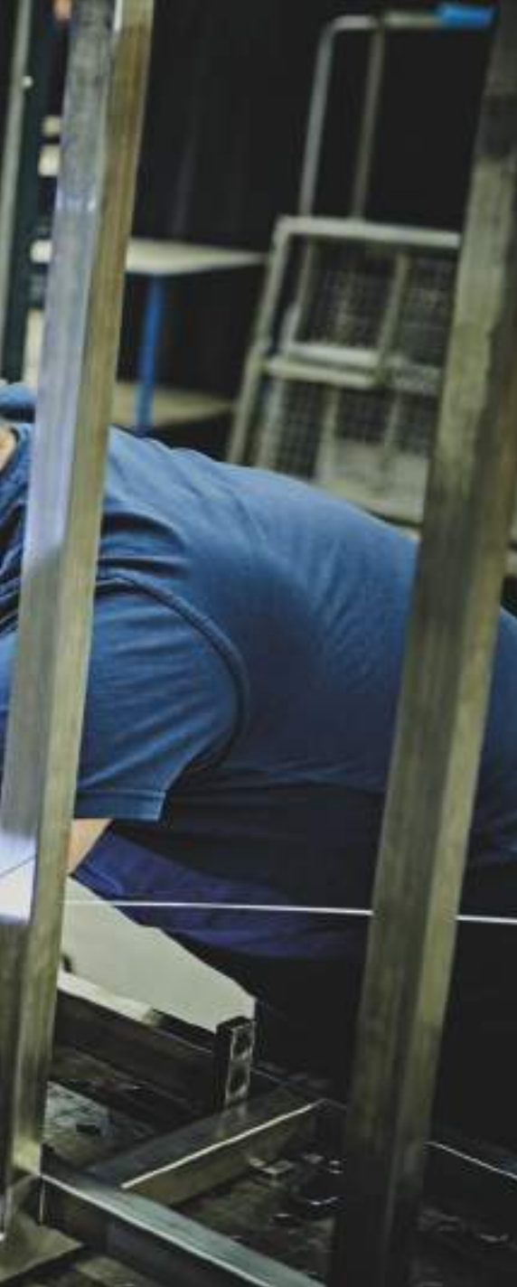
III. left assembly production of stainless steel components (TIG welding) III. top hygiene requirements – edges to prevent dirt accumulation III. middle primate-safe cage closures III. bottom clean and corrosion resistant weld seams (TIG-welding)