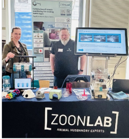
Animal Welfare Conference Essen

Great cities with wonderful impressions. And plenty of new insights we've gathered through the many interesting discussions we've had with you. We were accompanied by our partner iMouse , who are happy to take on board our scientific and commercial advice.