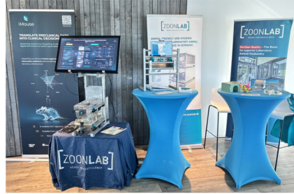
Animal Welfare Conference Travemünde