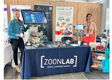
Austrian 3R Days Vienna

Haven't had a chance to meet us in person yet?