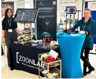
IGTP Spring Meeting Munich