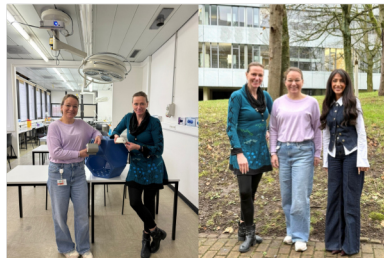
Training Session Düsseldorf

We'd be delighted to visit for training purposes. Simply get in touch with us!